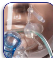
Dedicated access for Nasogastric tubes