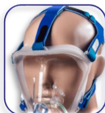
The 5th fastening point allows greater grip on the patient's forehead