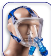
Configuration with single tube ventilators or CPAP generator