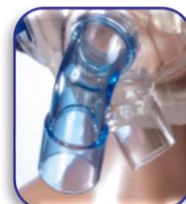
Connection "NonVented" for bi-tube ventilators