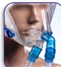
Configuration with bi-tube ventilators