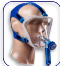
Configuration for CPAP with venturi generator "Easy Vent"